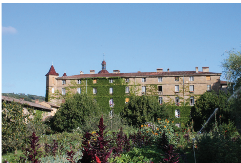
L'Arche de Saint Antoine