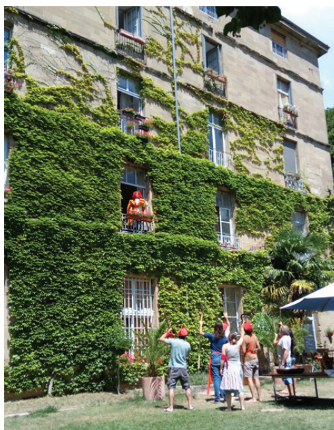
Bastille Day celebration in the L'Arche Community

Apart from the educational part of the course, we also enjoyed a dance evening where we danced international dances from all over the world including the famous Croatian ring dance. We also enjoyed two Bastille Day celebrations, one in the community and one in the village. Seven days flew by too fast, but we were left with knowledge, self-reflection, discussions, laughter and mutual bonding. The twenty-five perfect strangers from the beginning of the story became friends at the end of the 7-day course and hope to stay in contact for as long as possible.