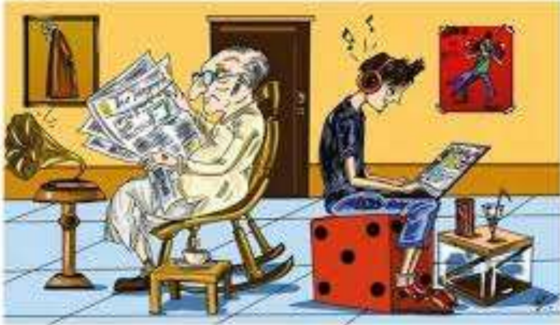
The Generation Gap

Describe the photo mentioning all the relevant facts related to the generation gap. You have to talk for a minute.