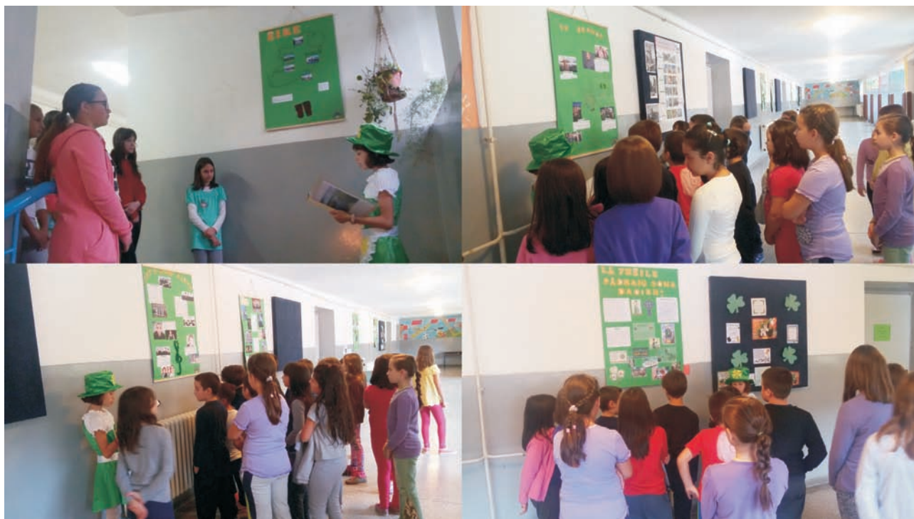
Photo 3 Guided tours through the school corridors

The last in line was the poster about Saint Patrick's Day. It's celebrated on March 17th and people usually dress up in green. The symbol of Ireland is a shamrock which actually symbolised Christianity at the very beginning or more precisely the Holy Trinity.