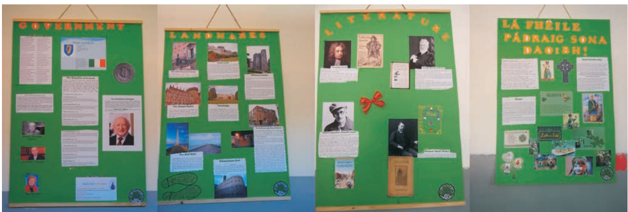
Photo 2 - Posters

There are so many sights worth seeing in Dublin that we simply had to make three posters. And even that wasn't enough to include all Dublin's landmarks. Children liked the National Leprechaun Museum very much because it's about leprechauns and all things inside are extremely big so visitors are actually as tinny as leprechauns. They were fascinated with Merrion Square after finding out how many famous Irish writers had lived there. There was Saint Patrick's Cathedral on one of the posters and they were very proud of themselves to remember that there are two cathedrals of the same name, one in the USA and the other one in Australia. Then they noticed Saint Mary's Church which is no longer the church but it has been turned into a restaurant and a pub. Kilmanheim Gaol was among the landmarks that drew their attention on the first sight because of the building itself. For those among you who don't know this it used to be a prison. Today it's a museum.